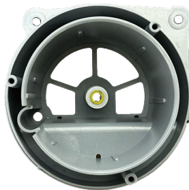
Standard Pressure Adapter