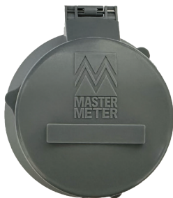
Cover & Shroud