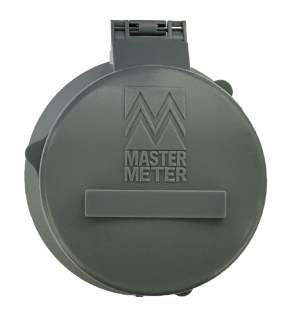
Cover & Shroud