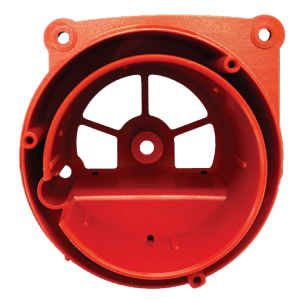
Pressure Compensation Adapter