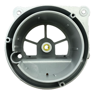
Standard Pressure Adapter